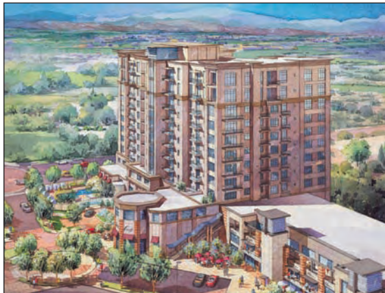
Landmark • Greenwood Village