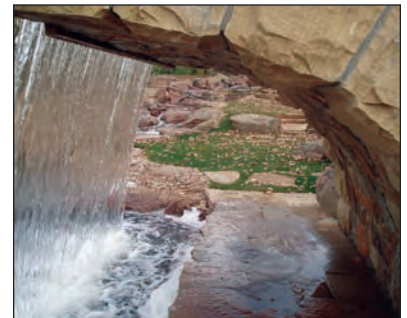
Private residence • Greenwood Village