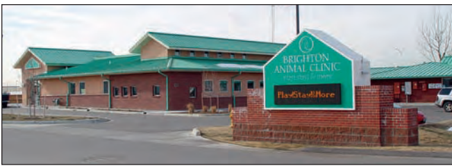
Play! Stay! & More... / Brighton Animal Clinic • Brighton