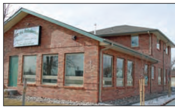
Bernard's Custom Construction Sabott Dental Center • Brighton