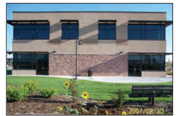
Salud • Fort Lupton