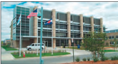
Biomedical Pharmaceutical • Longmont