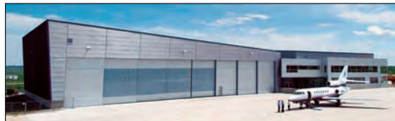
SunBorne • XJet • Centennial Airport