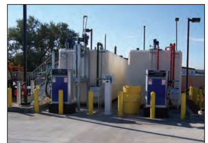
IRS Fuel Farm • Wheat Ridge