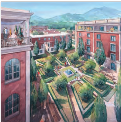
European Village • Greenwood Village