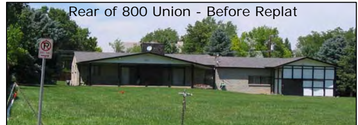
Rear of 800 Union - Before Replat