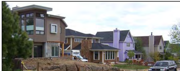
735 Utica Avenue