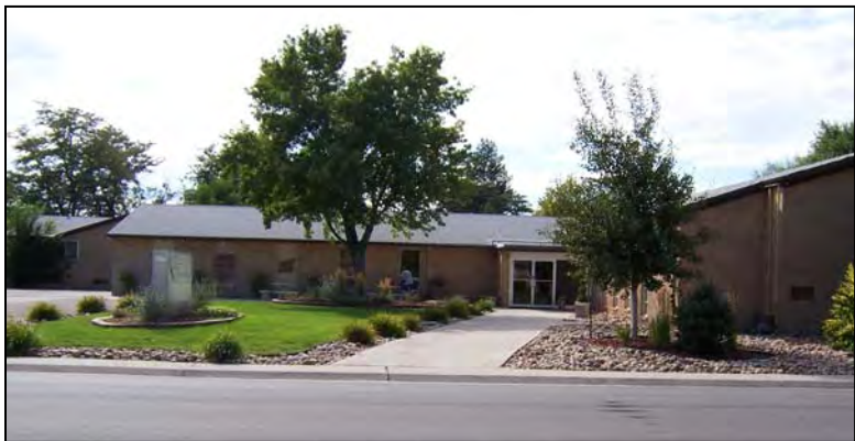
The picture to the left is of the east front of the Funeral Home—only minor modifications are proposed to the east side of the existing property, including a detention pond along the north boundary.

The Tabor Funeral Home project will add a 1,500 square foot garage, a new 45 stall parking lot, landscaping to enhance the new parking lot, and significant drainage improvements. The new parking lot will significantly reduce the current on street parking demands.