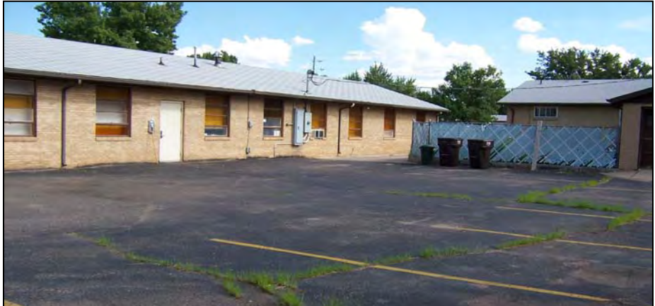
The picture above shows the existing rear of the Funeral Home (left) to receive a new garage and parking lot. The home to the right is the original Church of Nazarene Pantry to be removed and replaced with a new parking lot.

Bernard's Custom Construction specializes in site development and custom residential and commercial-retail-office design-build services.